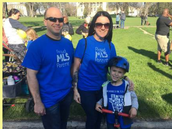
All decked out for the parade!!