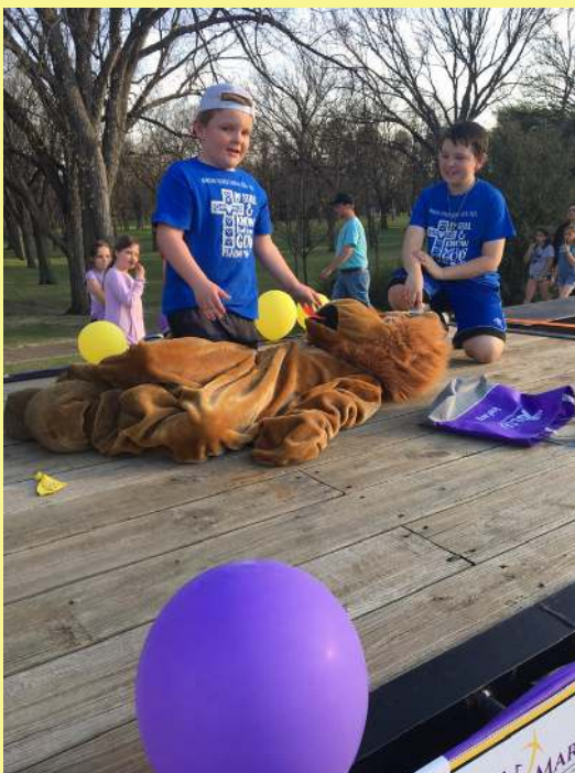
Luther Lion Getting CPR